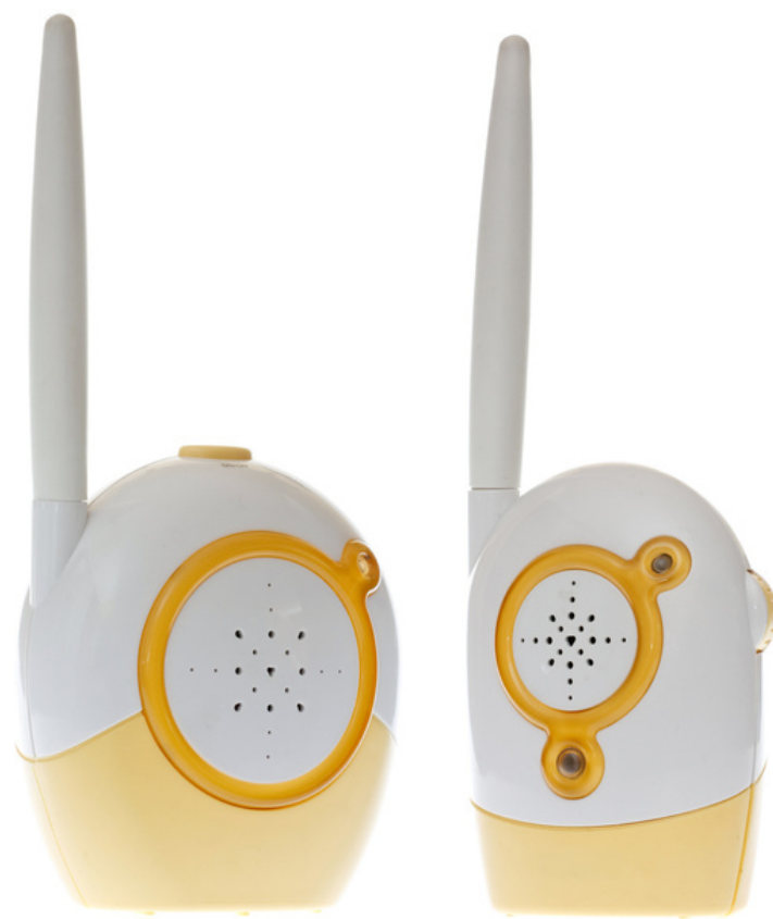
baby monitor bébimonitor