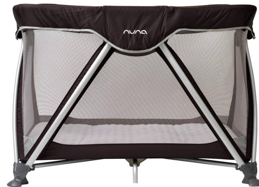
travel cot utazóágy