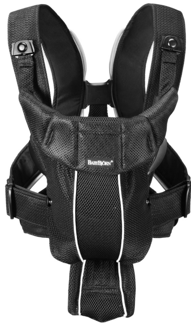
baby carrier kenguru