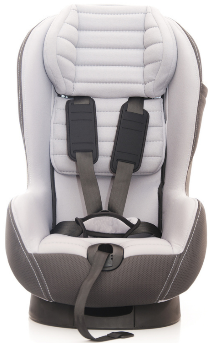
car seat gyerekülés