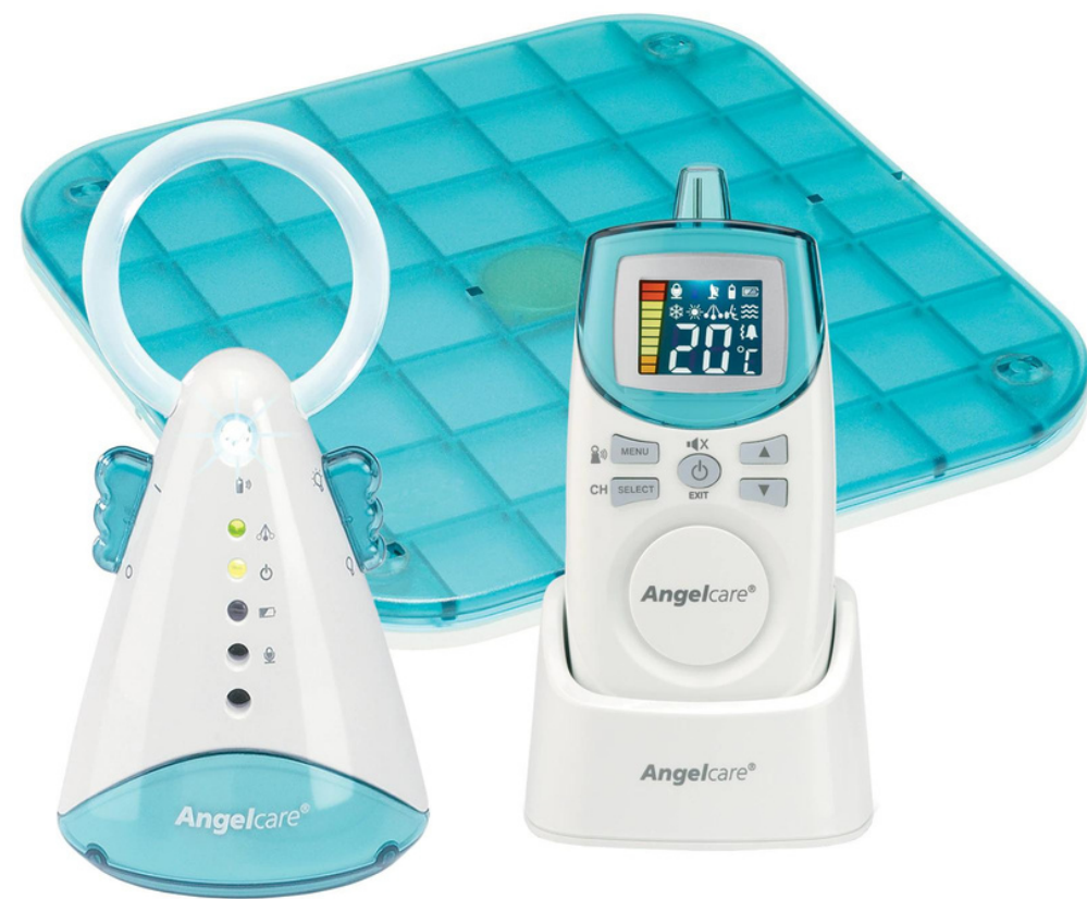
respiratory movement monitor légzésfigyelő