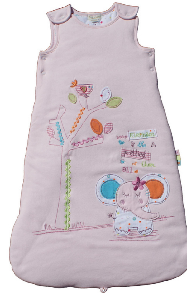
sleeping bag hálósák