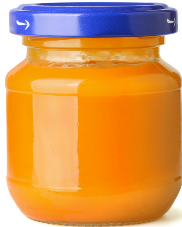
baby food bébiétel