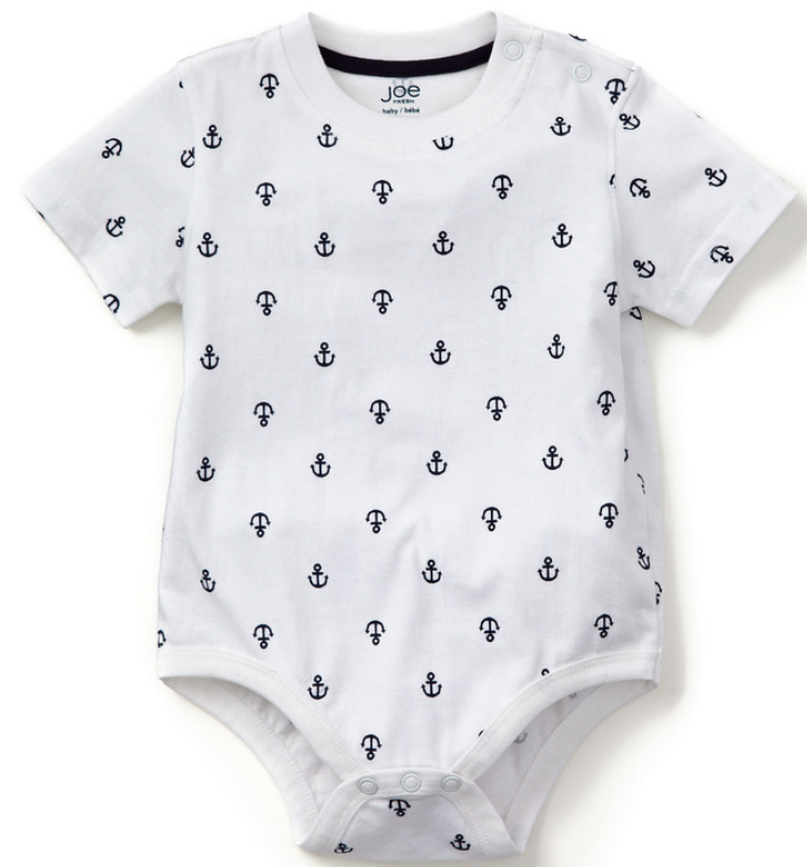
body suit body