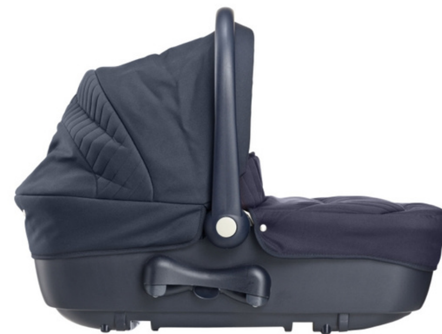
carry cot babahordozó