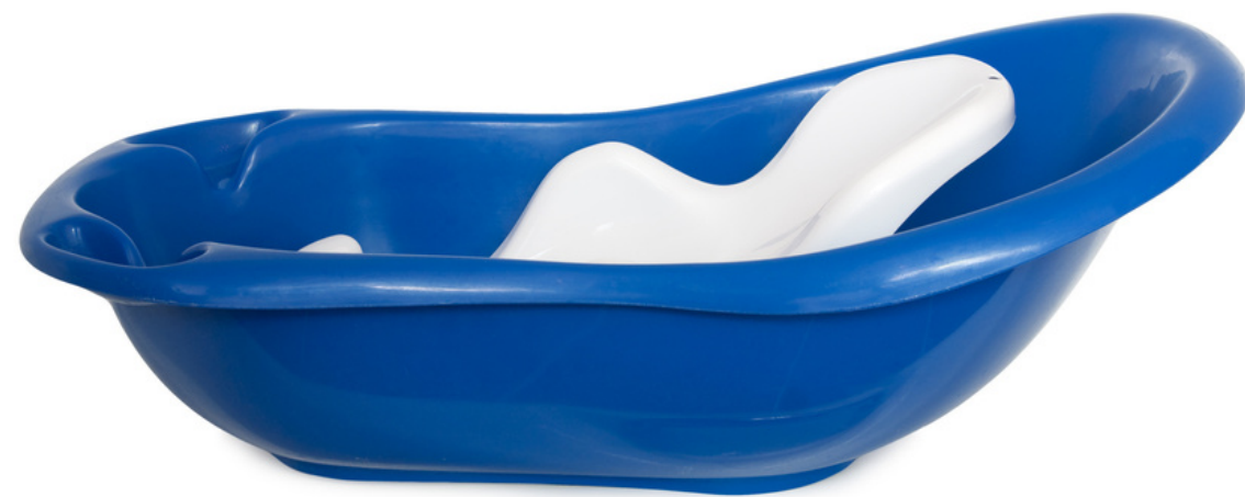
baby bath babakád