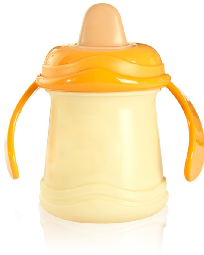
drinking cup csőrös ivópohár